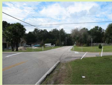
Sidewalk is planned for the east side of Hazen from the school to Plymouth Avenue

Recommendation: Although the west side of Hazen Road (north of Plymouth Avenue) appears to have more right of way, a sidewalk should be constructed along the east side of Hazen in this area if possible. This placement will allow the sidewalk to line up with the planned sidewalk on the east side of the road south of Plymouth Avenue. The planned crosswalk should connect these two sidewalks.