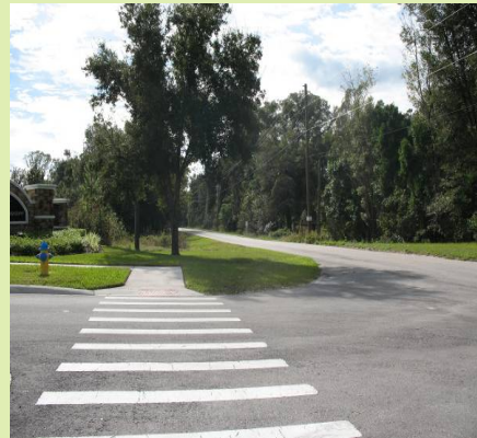
Hazen Road looking north toward the future school site

Recommendation: Construct a minimum 5' wide sidewalk connecting this subdivision to the existing sidewalk that terminates on the east side of Hazen Road, north of Minnesota Avenue. Consider making the intersection of Hazen Road with Minnesota Avenue a four-way stop.