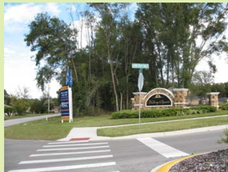
Sidewalk along Hazen Road is missing from Little Torch Key Drive to Minnesota Avenue

Recommendation: Construct a minimum 5' wide sidewalk connecting this subdivision to the Minnesota Avenue sidewalk. This sidewalk is recommended as a priority project and is further discussed at the end of this chapter.