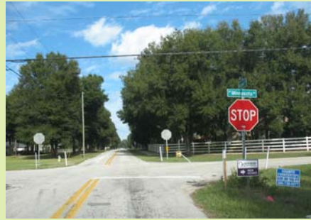
The intersection of Hazen Road and Minnesota Avenue should be reviewed for a four-way stop

Recommendation: Review this intersection for a four-way stop to reduce traffic speeds and provide traffic control to allow pedestrians and bicyclists a designated crossing. Provide crosswalks and signage in all directions. Review the need for a crossing guard at this location.