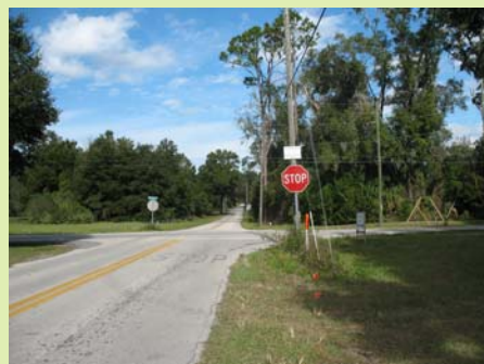
A crossing guard is planned for the intersection of Hazen Road and Plymouth Avenue.

Recommendation: The County may wish to consider adding traffic calming devices to make motorists aware that they are entering an area with increased pedestrian and bicyclist