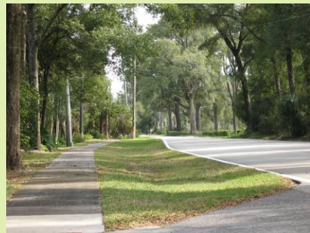
Plymouth Avenue looking east to where sidewalk ends

Recommendation: Construct a sidewalk to fill in the gap in the sidewalk area. Provide a signed crosswalk at the intersection of Hazen Road and Plymouth Avenue address across from Hunters Creek Drive, located on the east side of Hazen Road.