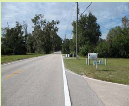
Plymouth Avenue looking west

Other Information: Currently, there is a two-way stop at the intersection of Hazen Road and Plymouth Avenue, with through traffic on Plymouth Avenue. This intersection will be improved to include a four-way stop when the school is opened.