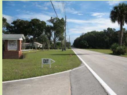
There is a missing section of sidewalk along the north side of Plymouth Avenue

Recommendation: Construct a sidewalk to fill in the gap in the sidewalk area. Provide a signed crosswalk at the intersection of Hazen Road and Plymouth Avenue address across from Hunters Creek Drive, located on the east side of Hazen Road. This project is recommended as a priority project and is reviewed further at the end of this chapter.