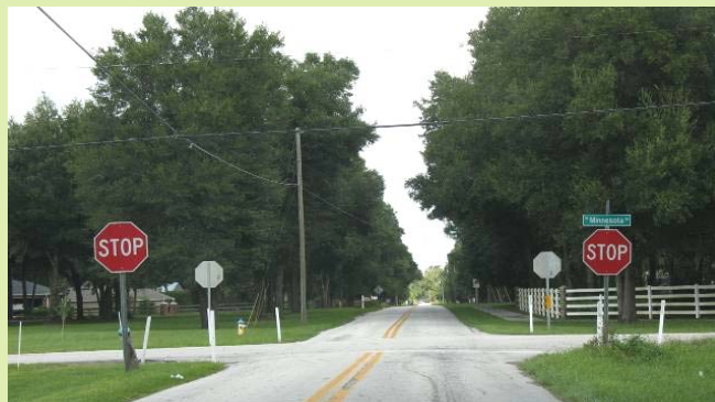
Two stop signs at Minnesota Avenue emphasize the stop condition for motorists on Hazen Road