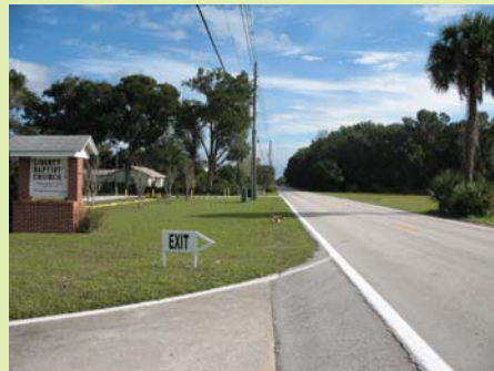
Plymouth Avenue looking east at Liberty Baptist Church