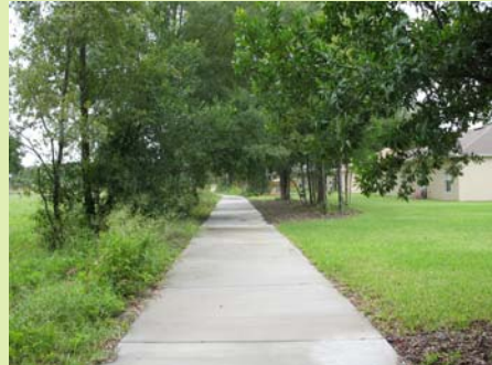
Existing trail within Forest Trace Subdivision may provide an ideal connection to Elementary School "Z"

This recommendation is under review by the developer, the City of DeLand and school district staff.